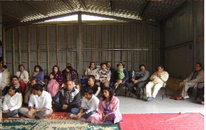
Participants in the prayers & foundation laying ceremony.