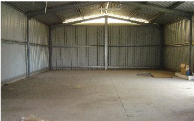
The Hall to be renovated