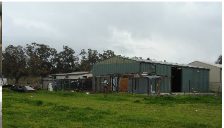
View of warehouse from South.