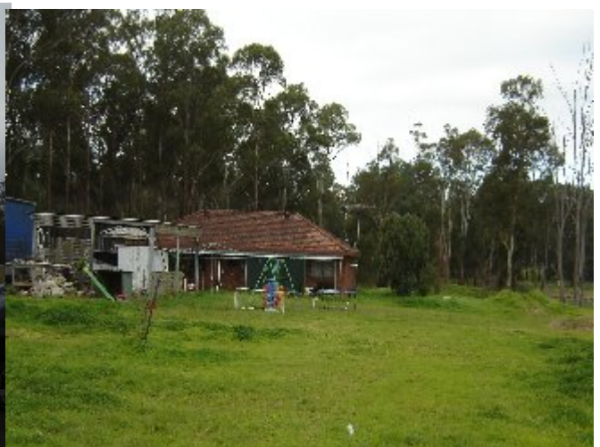
Existing Three Bedroom House.