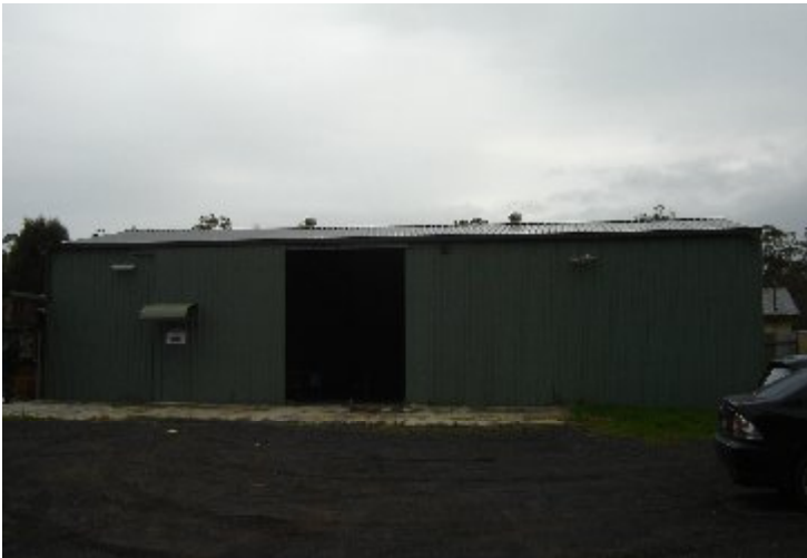
Existing Warehouse 1050 Richmond Road